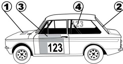
Plate 1 Front plate (43cm x 21.5cm)

The organisers will supply each competitor with one set of front door panels which includes competitor numbers which must be affixed as indicated below. If it is ascertained at any time during the rally that any competition number or rally plate is missing, a cash penalty will be imposed. If two competition numbers or rally plates are missing at the same time, the car will be excluded from the event.